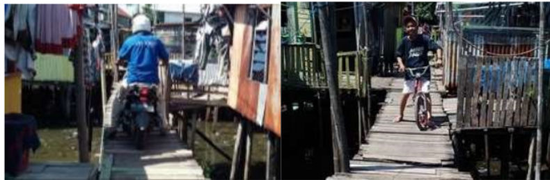
Figure 9. Motorcycles and bicycles using the titian.

Here is a figure of the titian that has undergone the development into a concrete bridge in the settlement on the water Bajoe bone district, and housing on the water in Pontianak. Titian has been developed into a wider concrete road/bridge that can be traversed by cars and motor vehicles, connecting residential areas with urban centres, in addition to improving the circulation of human beings as well as the circulation of goods and services. Use of reiling on both sides of the catwalk for the security of the user of the titian