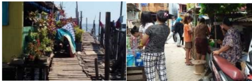
Figure 5. Functions of the titian as a motorcycle parking and social and economic interaction.