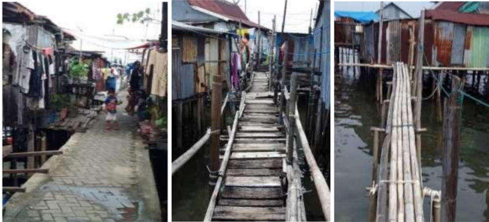
Figure 2. Street dimension in Karabba and Marbor kampong.