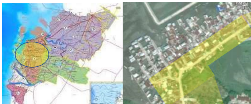
Figure 1. Study location. Kampung of Karabba and Marbor (District Tallo, sub-district Buloa) The yellow colour is the mainland area with concrete roads, while the other is the shallow water area affected by tidal seawater.

The study takes place on the informal settlement area of the Karabba and Marbor coastal Housing sub-district of Buloa, District of Tallo.