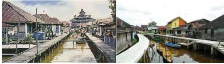
Figure 10. Kampung Beting Pontianak.

Titian in Kampung Beting Pontianak has been developed, so it is stronger and not easily decayed as before. The size though not according to the standard size of the path (2m) but has been traversed by two-wheeled vehicles from the opposite direction. The caution of road users is still needed because there is no railing on the path of the bridge.