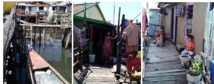
Figure 7. The function of the titian as a place to wash and bathe the child.