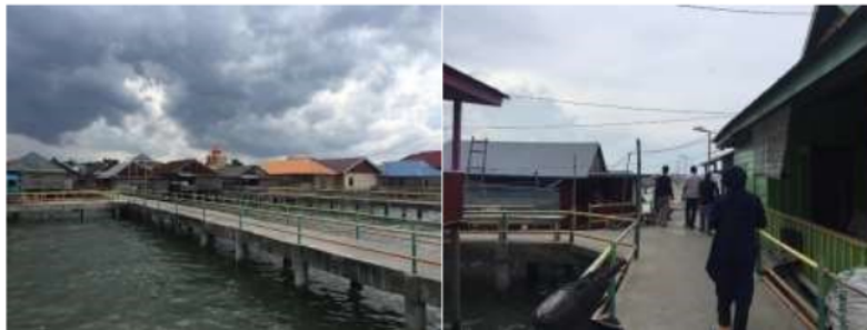
Figure 10. Development of titian in Kampung Bajo. Bone-Sul-Sel.