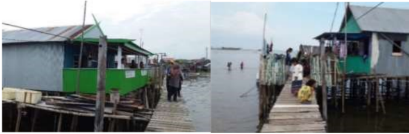
Figure 4. The function of Titian as pedestrian and play for children.