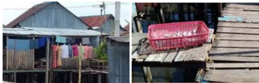
Figure 6. The function of the titian as clothes and fish clothesline.