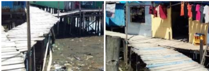
Figure 3. Marbor Titian is wider (1.5 m) and has branches/intersections.